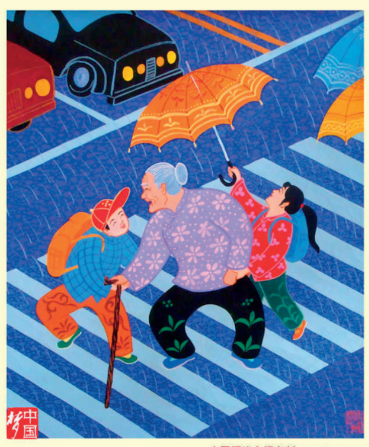
中国网络电视台制 河南舞阳 任明兆作