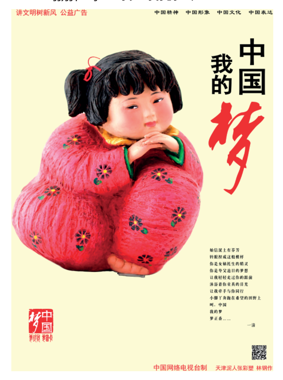
Figure 5.4 Designer: Public Service Advertising Art Committee; figurine designed by Lin Gang. Title: Wode meng (The Chinese Dream is my dream). Publisher: China Internet Television Station. Date of publication: 2013. No print number. Available on website of the Civilization Office under the CCP Central Committee: http://www.wenming.cn/jwmsxf_294/zggygg/pml/zgmxl/201309/t20130930_1501267.shtml