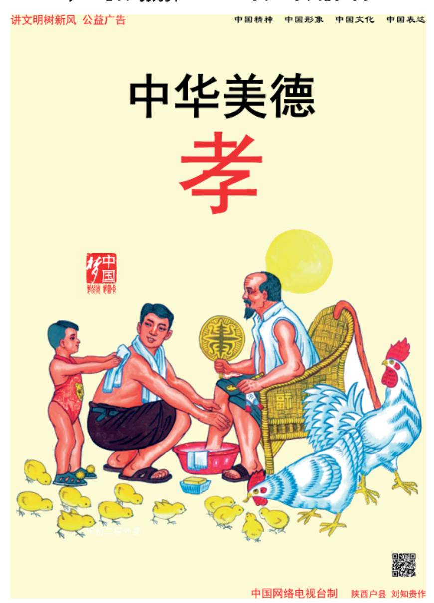
Figure 5.5 Designer: Public Service Advertising Art Committee; image designed by Liu Zhigui. Title: Zhonghua meide – Xiao (Chinese virtue – filial piety). Publisher: China Internet Television Station. Date of publication: 2013. No print number. Available online on website of the Civilization Office under the CCP Central Committee http://www.wenming.cn/jwmsxf_294/zggygg/pml/ctmdxl/201309/t20130929_1500525.shtml